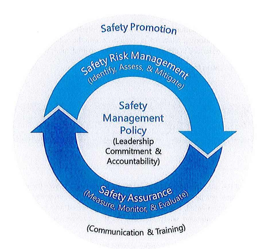
FIGURE 2: SAFETY MANAGEMENT SYSTEMS

SMS is comprised of four basic components - SMP, SRM, SA, and SP. The SMP and SP are the enablers that provide structure and supporting activities that make SRM and SA possible and sustainable. The SRM and SA are the processes and activities for effectively managing safety as presented in Figure 2.